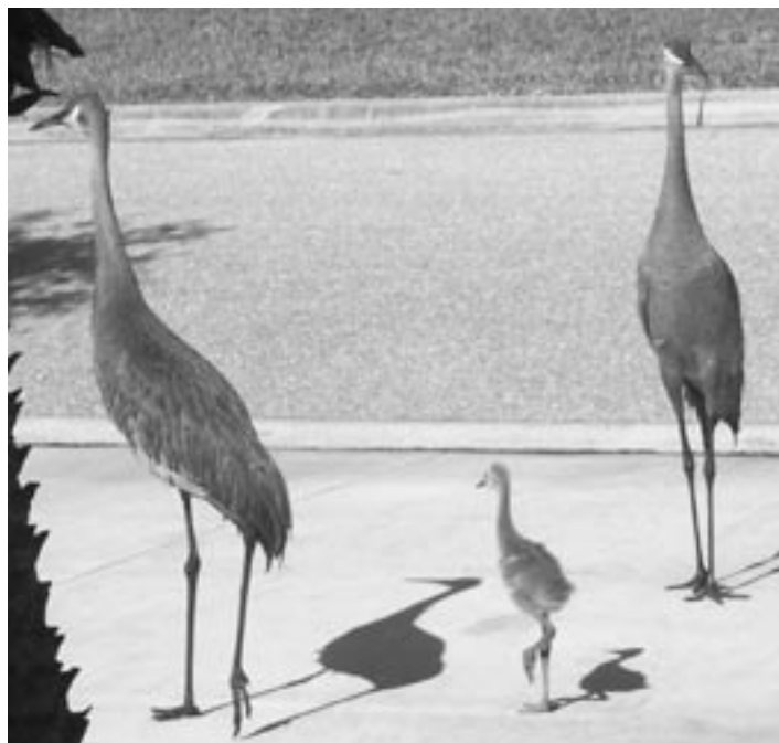
New Residents, Mr. & Mrs Sandhill Crane, stroll along the circle with their newest addition.

Sandhill Cranes are found in inland shallow freshwater marshes, prairies, pastures, farmlands, and lawns. Florida has both resident and migratory populations. The Florida subspecies is slightly smaller and darker than the visiting birds. Many of the migratory birds winter at Paynes Prairie. Large, bulky nests are usually built over water or on floating vegetation. Usually two eggs are laid. After about 30 days of incubation, the eggs hatch, and within 24 hours, the young leave the nest to follow their parents. They will be able to fly within 2.5 months but won't be on their own until they're about 10 months old.